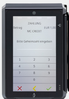
FIGURE 2 PIN on glass option at the exit