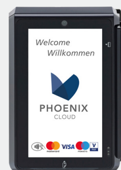
FIGURE 1 Welcome screen on 5" color display