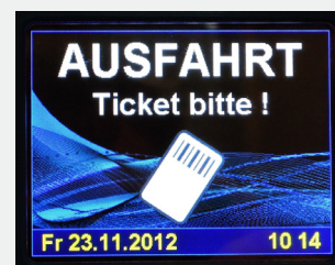
FIGURE 2 Displayscreen at the exit terminal