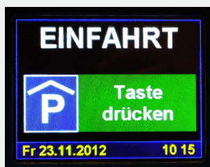
FIGURE 1 Displayscreen at the entry terminal