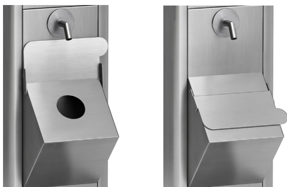
Figure: Disposal flap in open and closed state